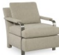
SKU 811-05 Elle