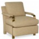
SKU 810-05 Elle