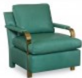
SKU L810-05 Elle