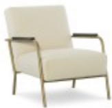
SKU 135-05GO Levi