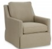
SKU 2485 Judy