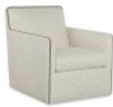
SKU 4451-05SW Miranda