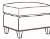
SKU 4451-07 Miranda