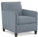
SKU 4451-05 Miranda