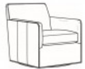
SKU L4451-05SW Miranda