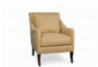
SKU 2995 Winthrop