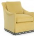
SKU 2985-SW Whittier