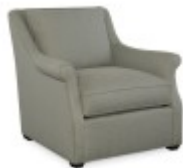
SKU 2010-05 Marcelle