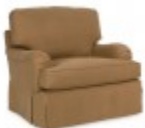
SKU CD8605E Custom Design