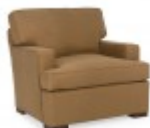
SKU CD8605T Custom Design